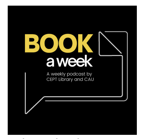
Book a Week Podcast