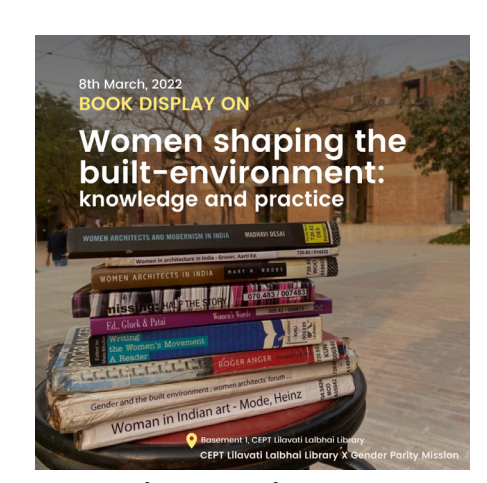
Thematic book displays