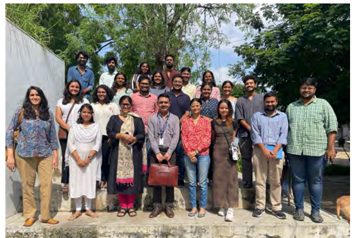
Figure7.2 - The MUI batch 2023-25 with officials from UNICEF