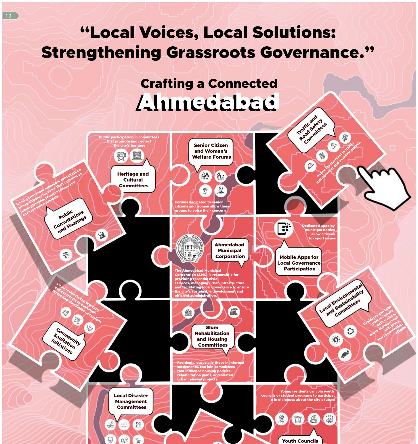
Figure12 -Poster for Prajatantra

Guruprasad’s poster highlights citizen participation in Ahmedabad’s local governance, showcasing initiatives like public consultations and contributions to sustainability, heritage conservation, and smart city solutions.