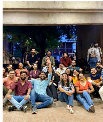
Figure10.2 - The FP senior batch showing appreciation for the junior batch's dance jugalbandi.