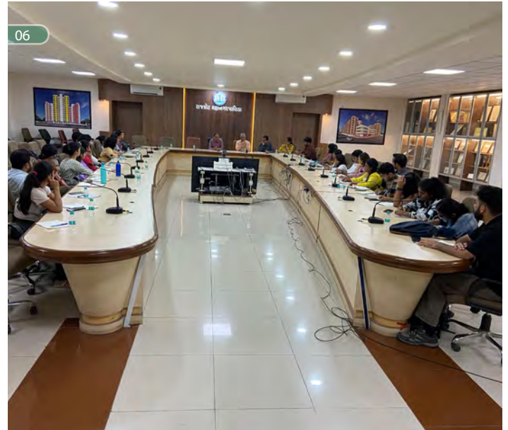
Figure6 - The MUI batch 2023-25 met with the Municipal Commissioner and Deputy Commissioner of Rajkot, along with officials from USAID and UNICEF, to discuss the infrastructure plan for the city.

The interactive session offered students real-world insights, expert guidance, and practical perspectives, enhancing the relevance and impact of their academic work for urban development.