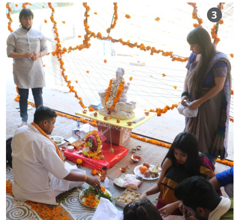
Fig 01. Wipro Earthian Competition Winners 2018, Fig 02. Performances by students in Roots Jam Night, Fig 03. Vasant Panchami celebration