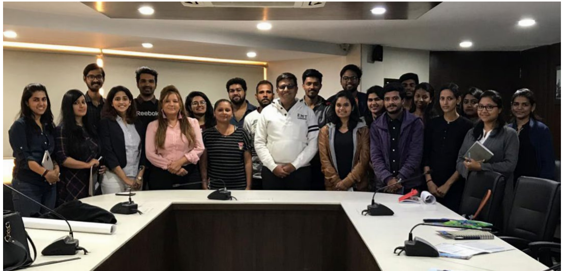
Input Lecture on PMAY in VUDA Office, Urban Housing Studio 2019