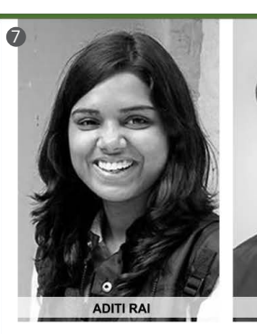
Planning of Urban Areas with Heritage Value Towards a Heritage Precinct Conservation & Improvement Local Area Plan: A case of Dhal-ni-Pol, Ahmedabad, India Aditi Rai & Jignesh Mehta