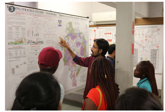
Fig 03. Spring Semester End exhibition, P.C Gokul K

The exhibition throughout the campus displayed the works of more than 1500 students, supported by more than 130 faculty members, and was a success for CEPT University.