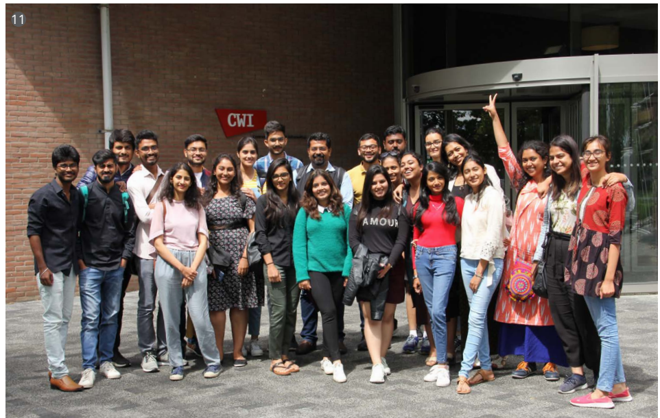
Fig 11 and Fig 12: "Blueprint for Urban Transformations: Learning from the Dutch Experience" SWS Group

Faculty of Planning | CEPT University | Newsletter