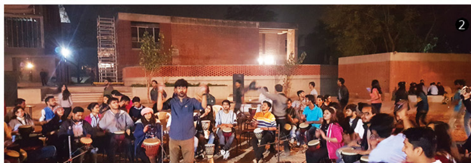
1. 'Urban Expansion through Town Planning Schemes'- Capacity Building Workshop; 2. Drum Circle ROOTS 2018

for 3 years on Energy and Integrated mountain development strategies. I also worked with CRY in Mumbai on child right issues which involved advocacy and intense groundwork. Later I joined CEPT as a faculty and got involved in urban development, regional planning, EIA and other urban capacity building initiatives.