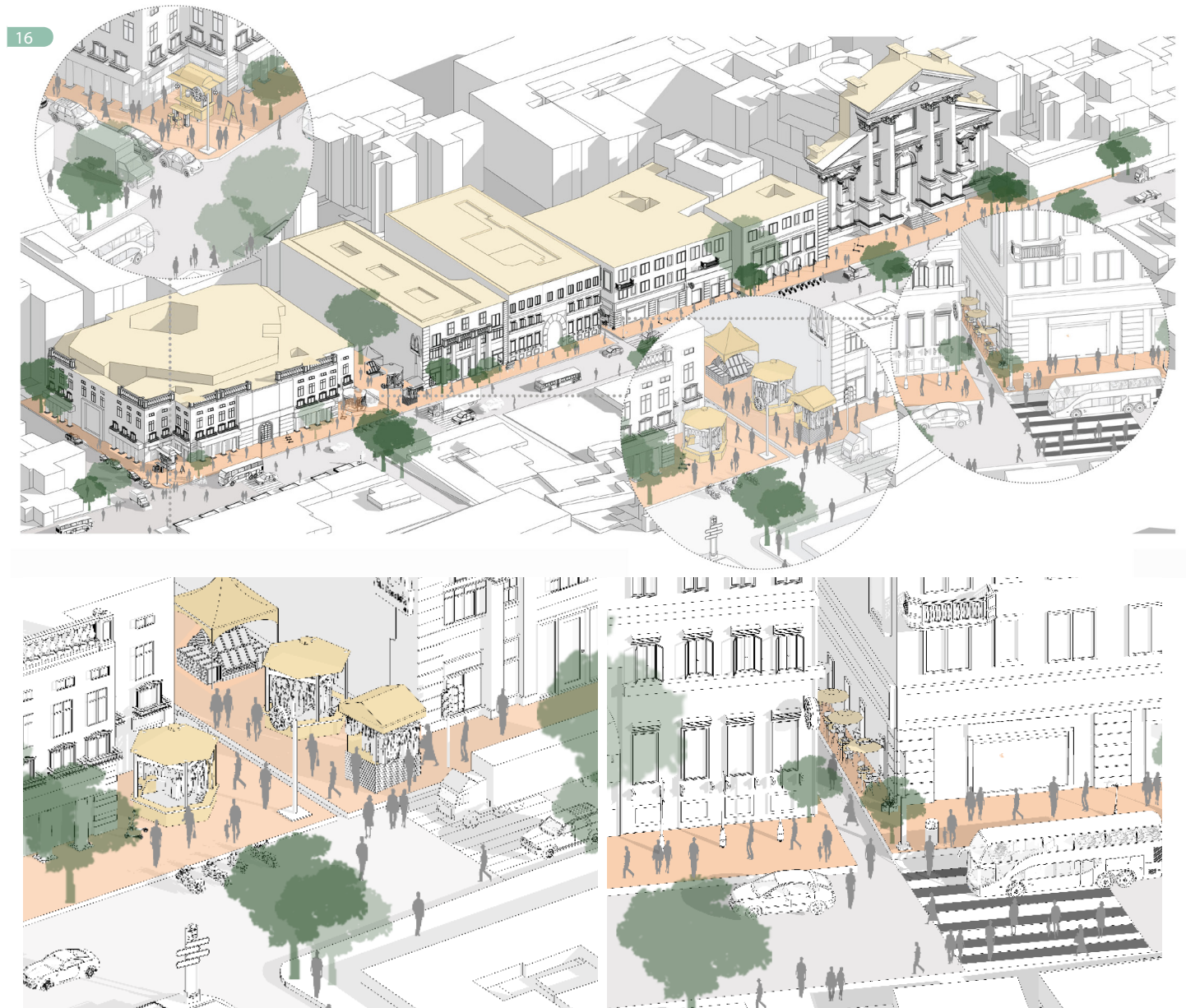
Fig 16 Graphics Explaining Via del Corso

Enhancing pedestrian zones, improving public transportation, and managing traffic flow can maintain its vitality while protecting its heritage. Sustainable development, community engagement, and strict heritage conservation are essential. Jan Gehl's seminal work, 'Life Between Buildings,' emphasizes the crucial role of prioritizing people's fundamental needs when designing urban public spaces. Via del Corso must continue to thrive as a dynamic and vibrant part of Rome through thoughtful, inclusive, and sustainable urban planning.