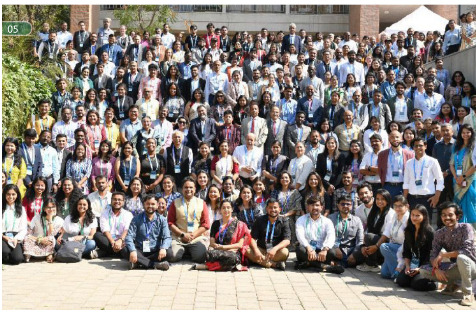
Figure 5 – Panel member and volunteers for the conclave