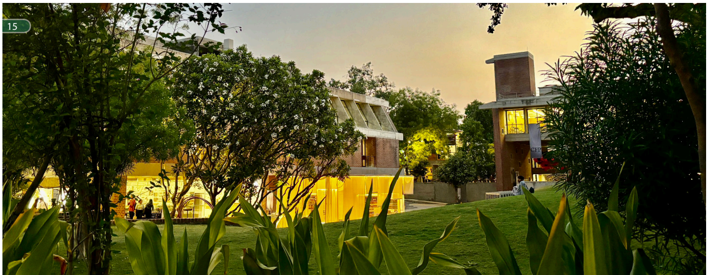
Figure 15- Tranquility Meets Architecture: A Glimpse of CEPT Campus .