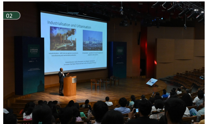
Figure 2- Session by Wg Cdr P Madhusoodhanan (Retd.)