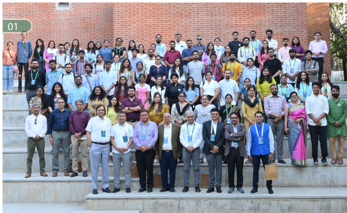
Figure 1- Keynote speakers with CEPT faculty, volunteers and conference attendees.

They presented - 'Harmonizing Industrial Policy with Urban Development: The Tamil Nadu Effort Paving the Way for Sustainable Growth,' 'Equity in Industrial Cities: Impact of policies in shaping future-ready industrial towns,' 'Urban transformation through redevelopment: experiences from Ahmedabad,' 'Eviction to Empowerment: Case of Jaga Mission-in-situ redevelopment of informal settlements,' and 'Implementation of TOD policy at Nagpur'. After the sessions concluded, the delegates visited the Summer Exhibition 2024.