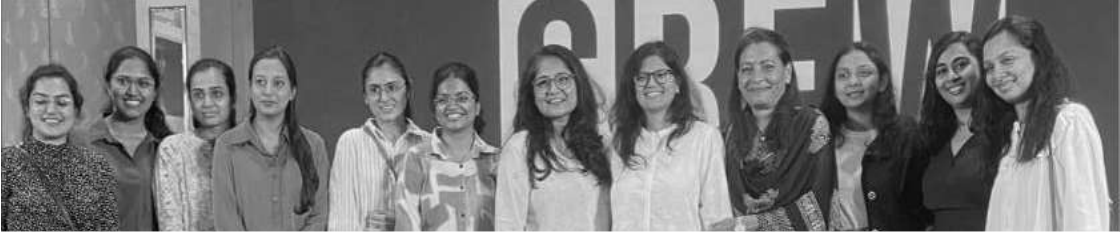
Collective of Real Estate Women (CREW), Ahmedabad Chapter