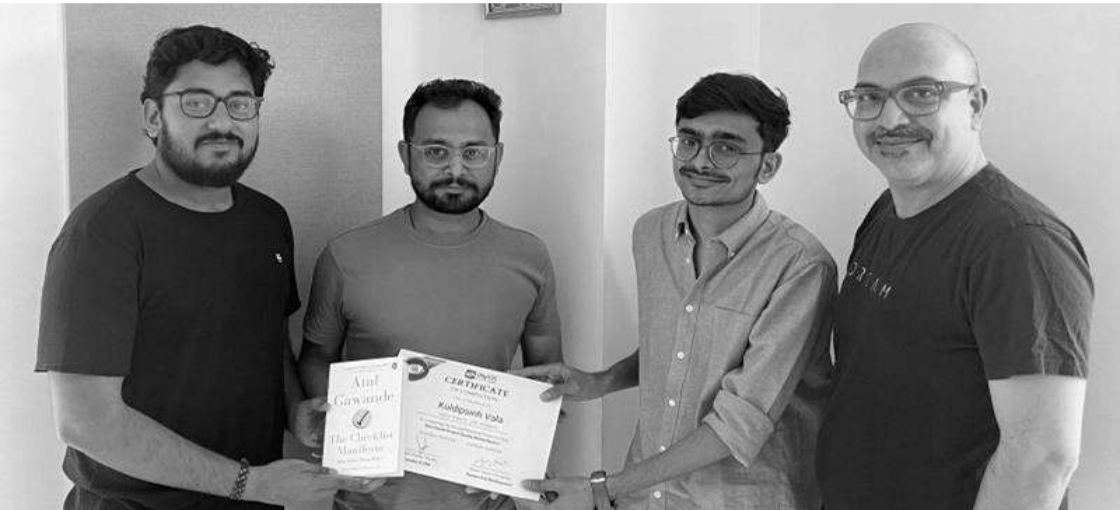
8th International Conference on Construction, Real Estate, Infrastructure, and Project Management (ICCRIP)