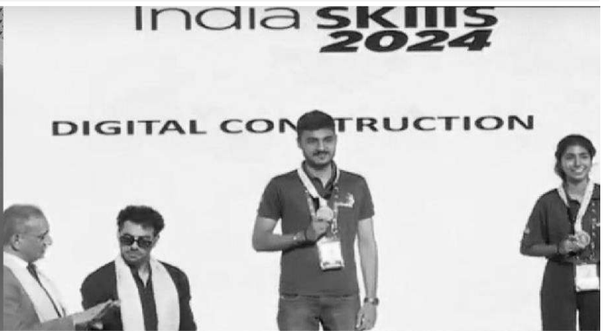
National Skill Competition 2024 organized by the National Skill Development Corporation (NSDC)