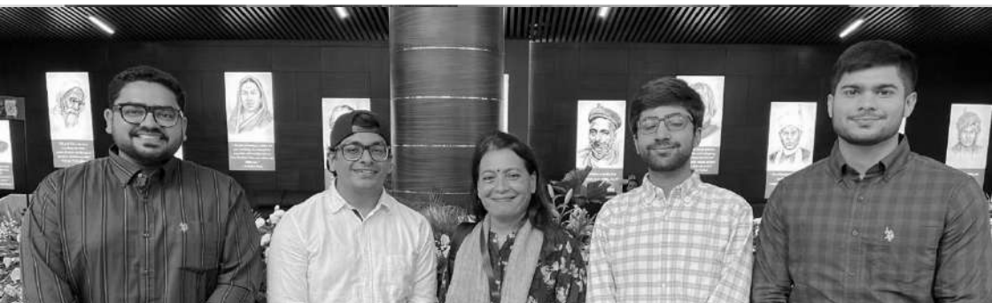
7th International Conference on Construction , Real Estate, Infrastructure and Project Management