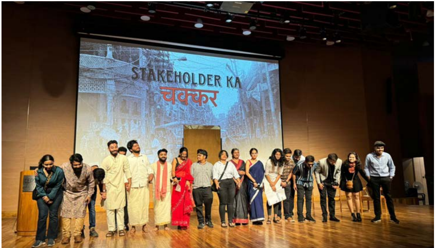
Figure7.3 - “Stakeholders ka Chakkar” Roleplay by FPPG Batch

The event also saw the launch of the Nagri Magazine, where the newsletter team presented articles on urban planning and student initiatives while the Sports’ Team proudly unveiled their new team T-shirts, symbolizing their unity and enthusiasm.