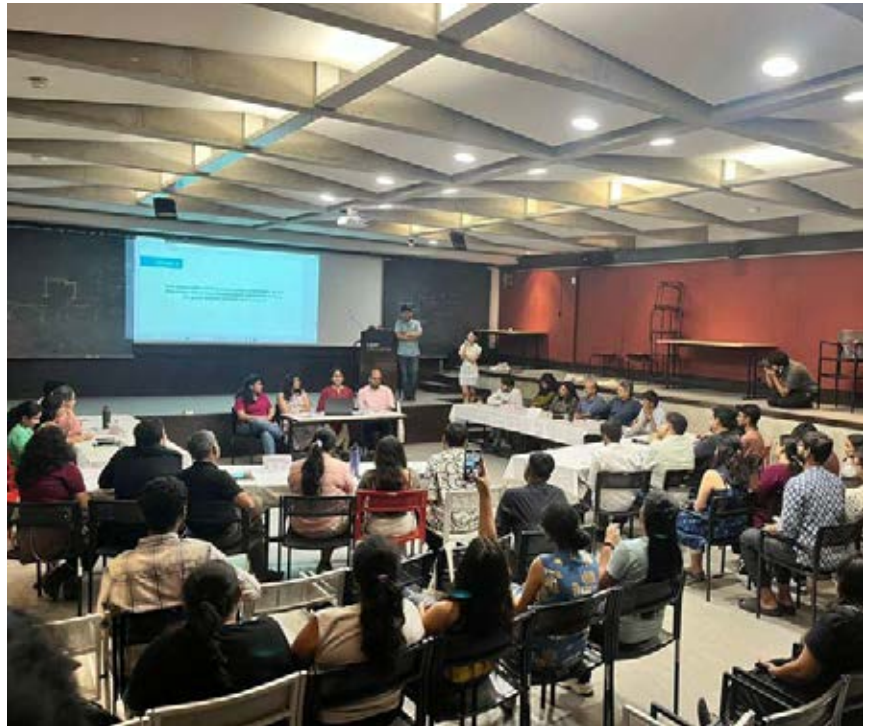
Figure7.7 - Students dance performance