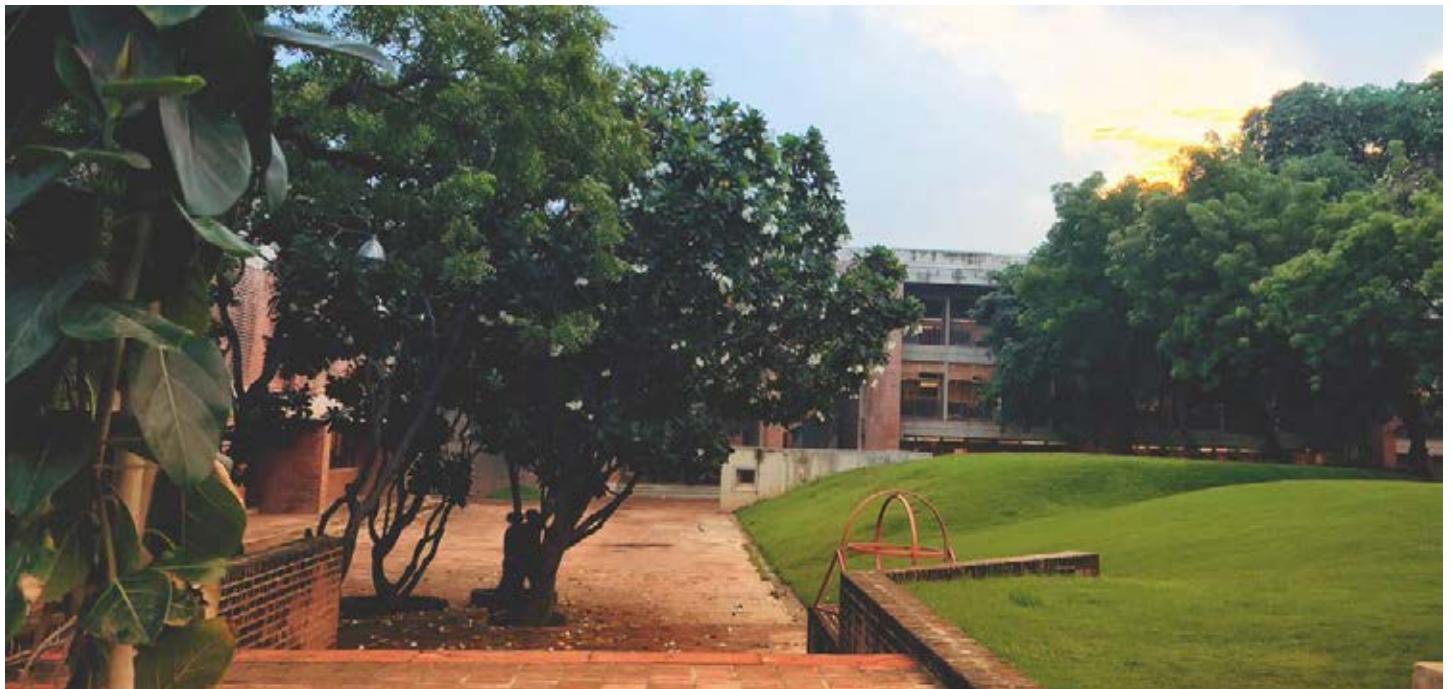
Figure8.2 - Life at CEPT