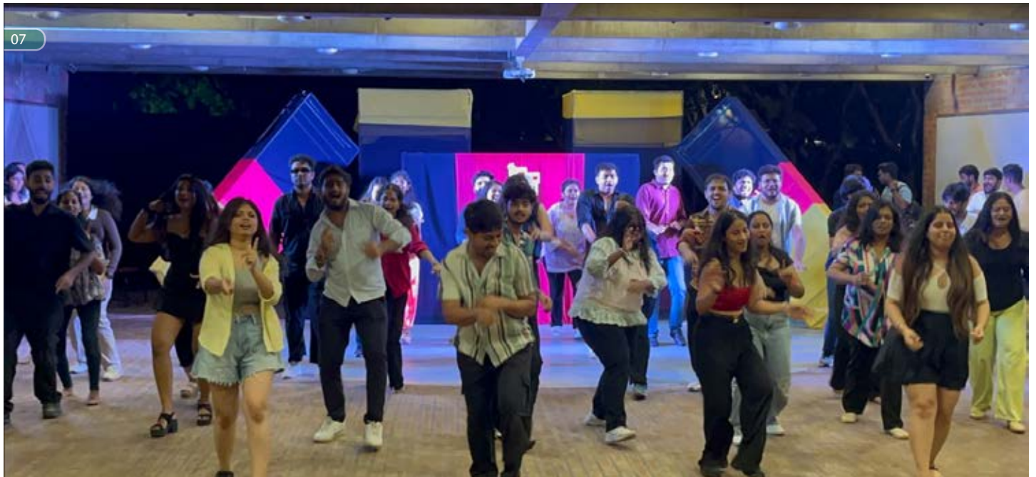
Figure7.1 - Students dance performance