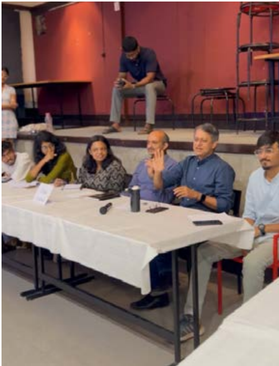
Figure7.6 - Faculty Students Debate

Overall, Prameya 24 successfully fostered student engagement, learning, and collaboration on key urban issues.