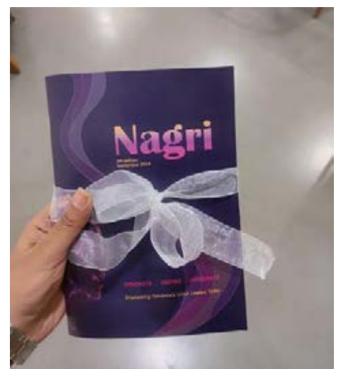
Figure7.5 - ‘Nagri’ magazine, curated by the FP Newsletter Team.