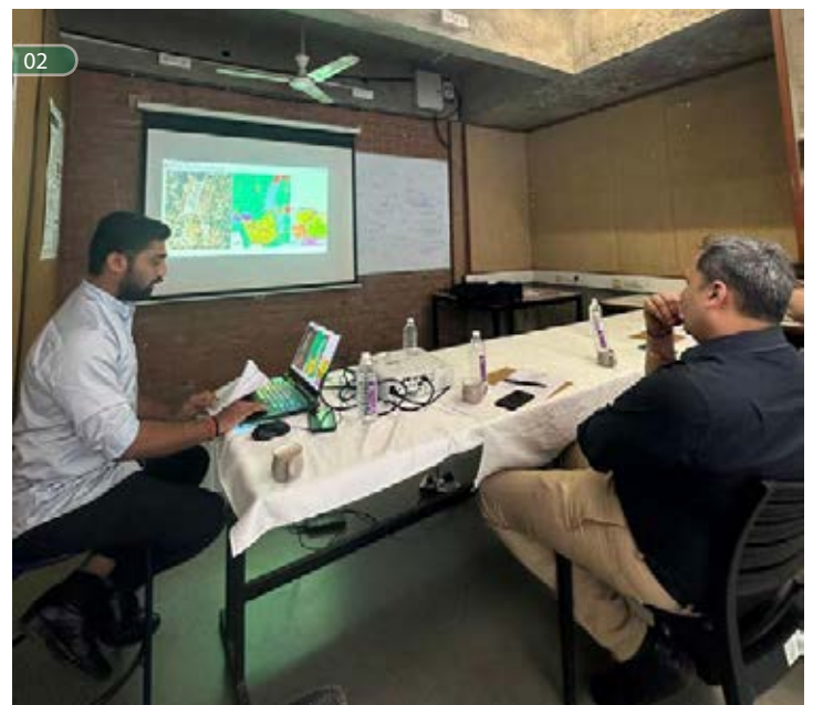
Figure 2 - Nil from MUH Batch 2023-25 showcasing the proposal for a Multi-Modal Logistics Park located near Ghodhavi, Ahmedabad.

This session gave students valuable insights into the financial and planning aspects of multimodal hubs, especially in the context of public-private partnerships (PPP), offering practical knowledge on making TOD projects sustainable and economically viable.