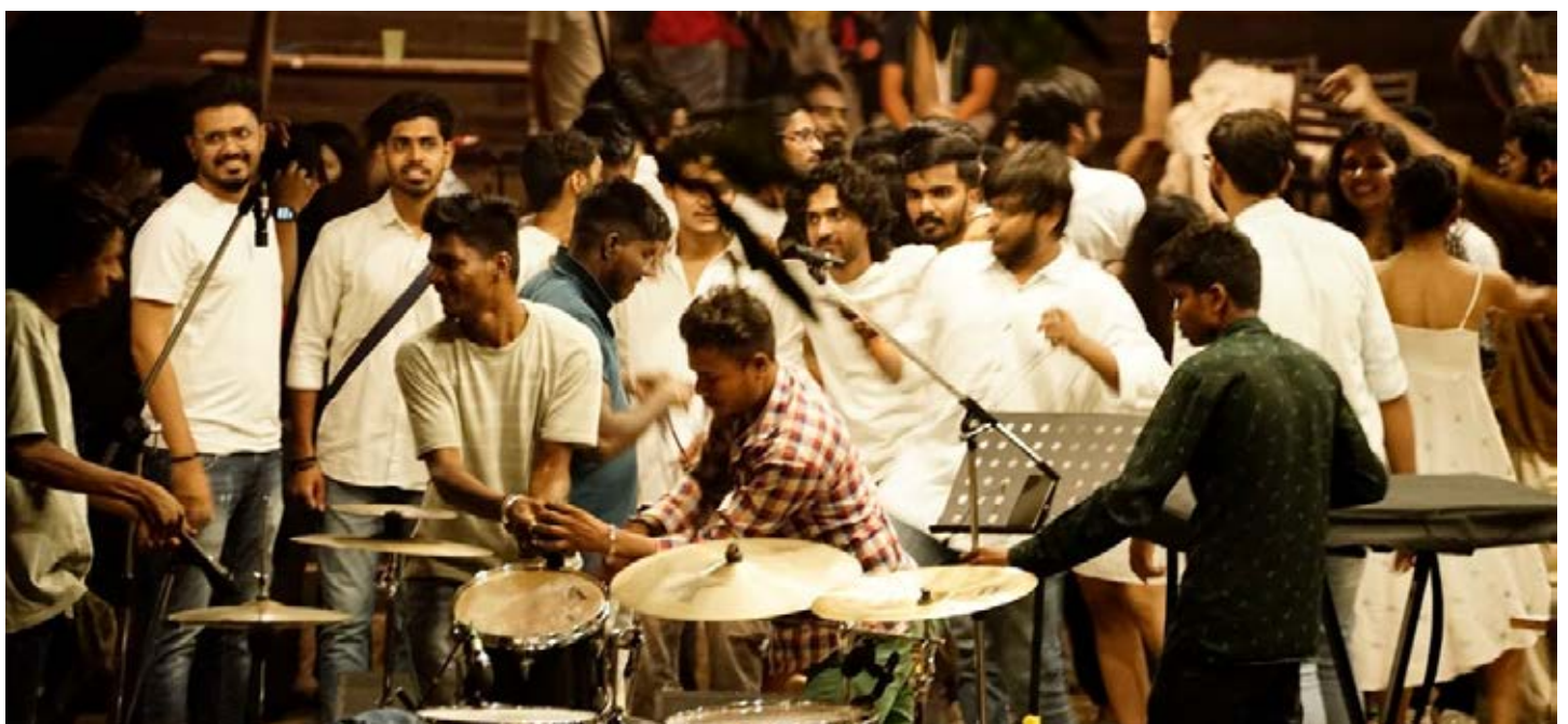
Figure7.2 - Band performance